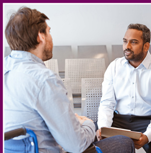
Managing expectations within practice teams