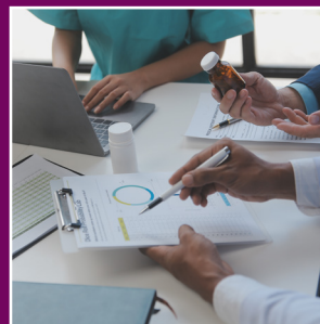
Identifying areas for operational improvement